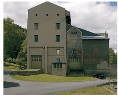
Hakavik power station

Building power plants can change water-flow patterns and water-courses, making it difficult for salmon and trout to reproduce. Statkraft is under an obligation to release fish in the watercourses to counteract such adverse effects. Over the years, this has turned into a major commitment. Statkraft has therefore built a number of fish hatcheries around Norway and is also involved in some joint ventures. Statkraft is constantly seeking to improve the natural environment for fish in the rivers and lakes and undertakes biotope improvement activities in many watercourses.