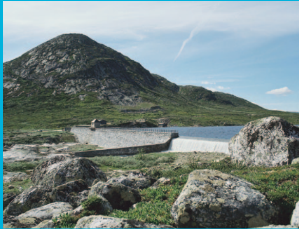
The Mår Dam