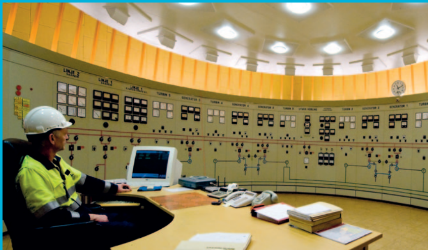
The control room at Mår power station