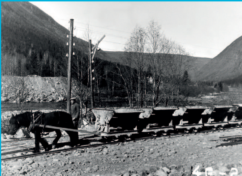
Horse and wagons at Dale

Stegaros power station came into operation. This plant utilises the fall between Mårvatn and Kalhovdfjorden (2.6 MW). Statkraft and Tinn Energi have equal joint ownership.